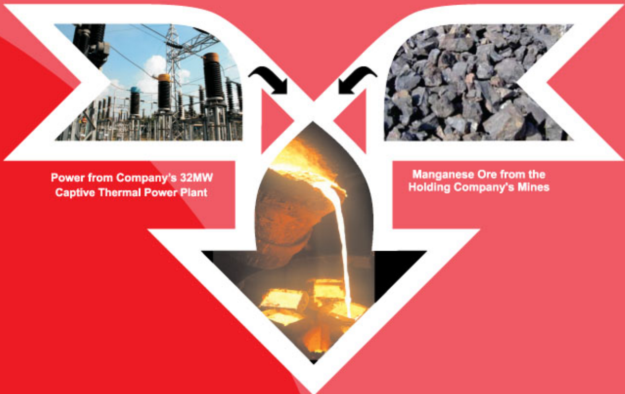
Power from Company's 32MW Captive Thermal Power Plant