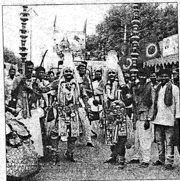
The 'Veeragase' artistes are the main attraction in the huge 'Shobha Yatre' taken out in Siruguppa recently to showcase the great Hindu emperors and kings.

on Monday, they said, they They will cross 18 big cities and other facilities in all the